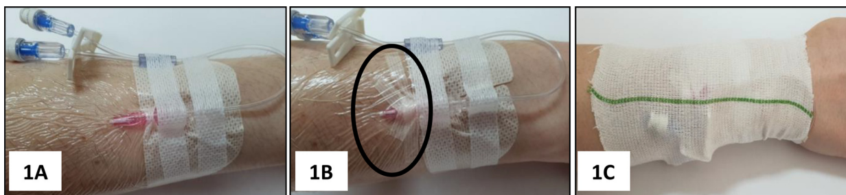
Fig. 1. A: Standard care – bordered transparent dressing plus two tape strips over dressing; Fig. 1B: Securement bundle 1 – Standard care plus two sterile tape strips over the PIVC hub (circled); and Fig. 1C: Securement bundle 2 – Bundle 1 plus tubular bandage.